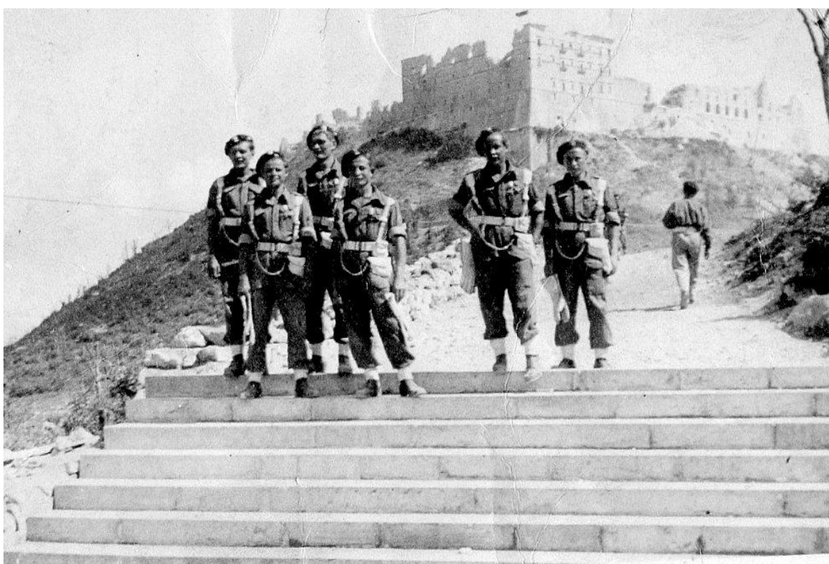
With the Polish Army, tank regiment on the steps of the destroyed Monte Cassino; Italy 1944.