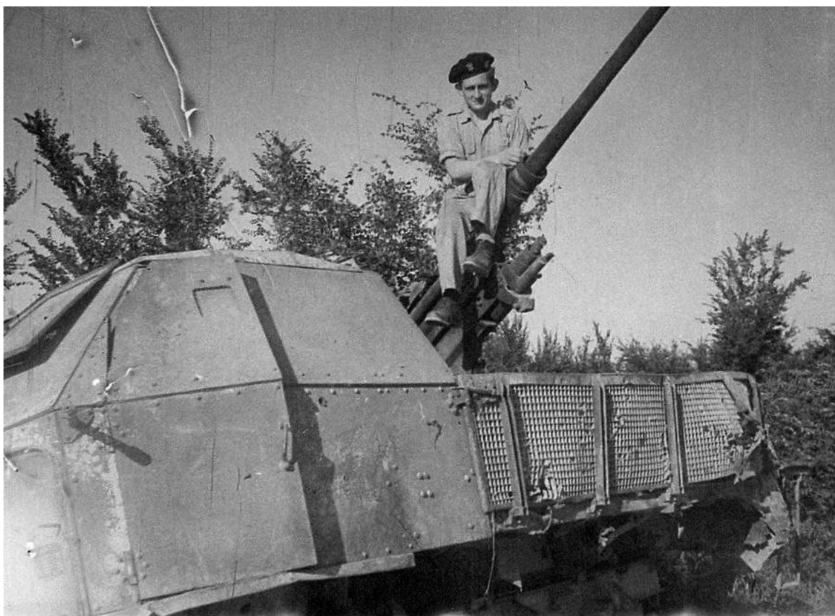
Italy; circa 1944.