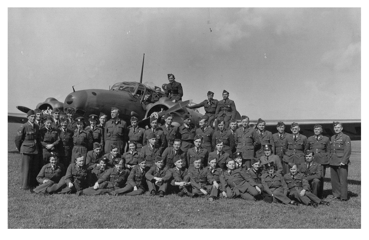
RAF Group photo with Polish pilots only, Urszula is third from left on the front row, Sealand, nr Chester 1944.